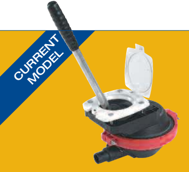
Pictured with Deckplate AS0356